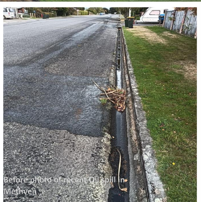
Before photo of recent Oil spill in Methven

A massive shoutout goes out to Beth and her team for their expert handling of the cleanup efforts following the oil spill in Methven. They're swift response and strategic approach undoubtedly minimised the impact of the spill on the local ecosystem and community.