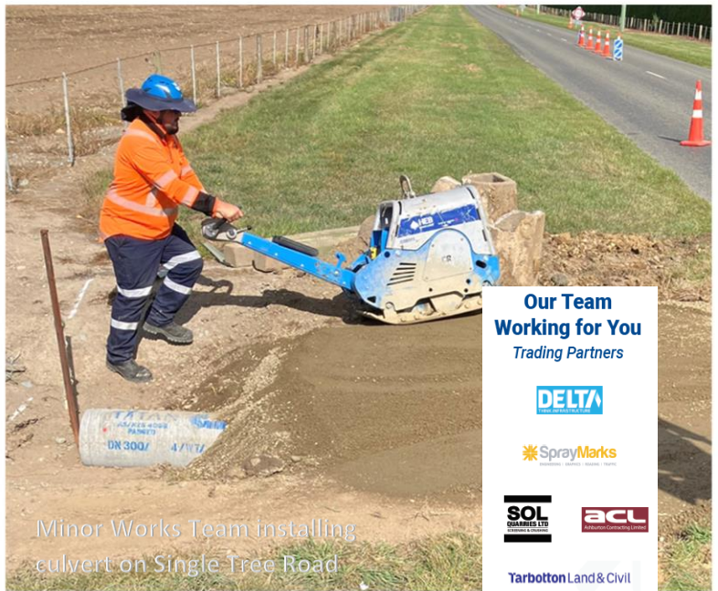
Minor Works Team installing culvert on Single Tree Road

Intersection signage upgrade – Northwest Quadrant