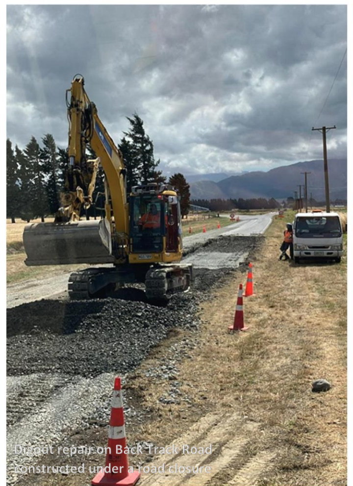
Digout repair on Back Track Road constructed under a road closure