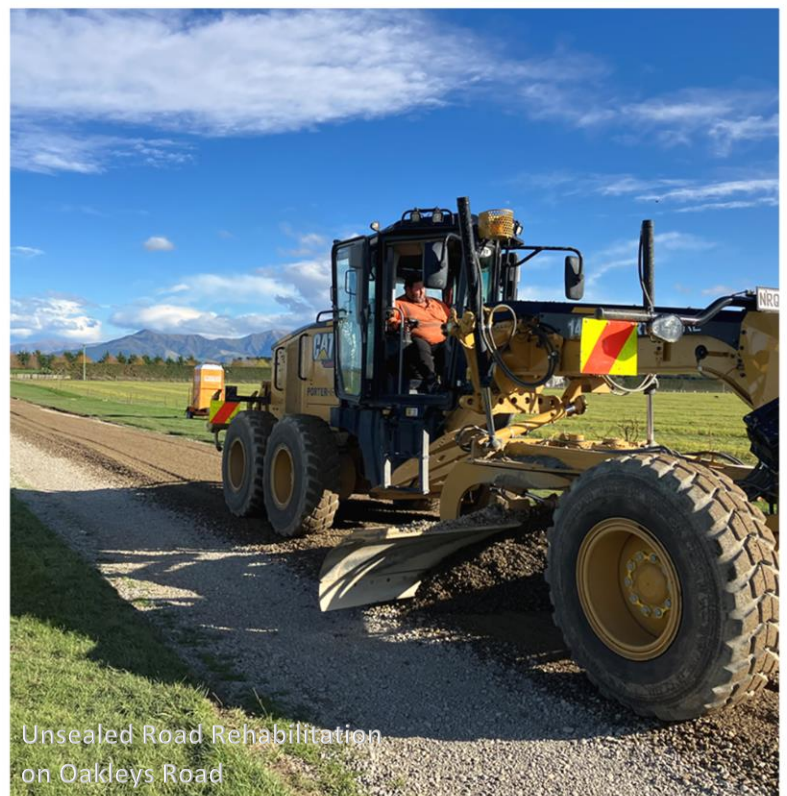
Unsealed Road Rehabilitation on Oakleys Road