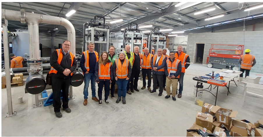
Members of the Methven Community Board and Council staff in the new water treatment building (above) and in the much-smaller old one (below).

Raw water from the Methven and Methven Springfield intakes will enter the facility and pass through a membrane filter that removes 99.9 per cent of micro-sized