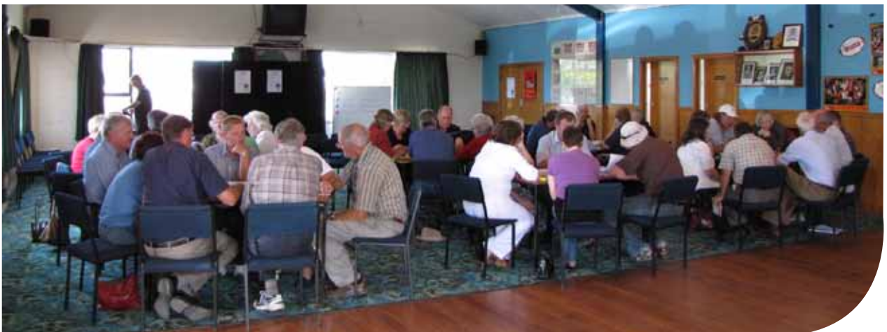
Workshop One Attendees, Rakaia Rugby Clubrooms, November 2008

To engage the youth of Rakaia, discussions were held with local intermediate and secondary school students on the school buses in the week preceding the first community workshop. Students were asked what they did or did not like about Rakaia, and what they would like to see for the future of the town. Results from this exercise were incorporated into the SWOT analysis findings.