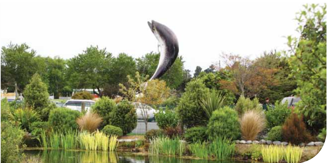
Salmon Tales Complex, 2008

Recreation and sports facilities and pursuits are an attraction Rakaia offers both residents and visitors. Strengths of the recreation opportunities available in and around Rakaia are largely focused on sport and outdoor recreation, such as the Rakaia Domain, the Rakaia Swimming Pool and the new Rakaia River Terrace Walkway. The community is keen to explore new recreation opportunities, such as a shared sports clubroom facility in the Rakaia Domain to provide for future community needs.