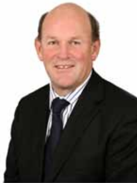
Mayor: Bede O'Malley Ashburton District Council