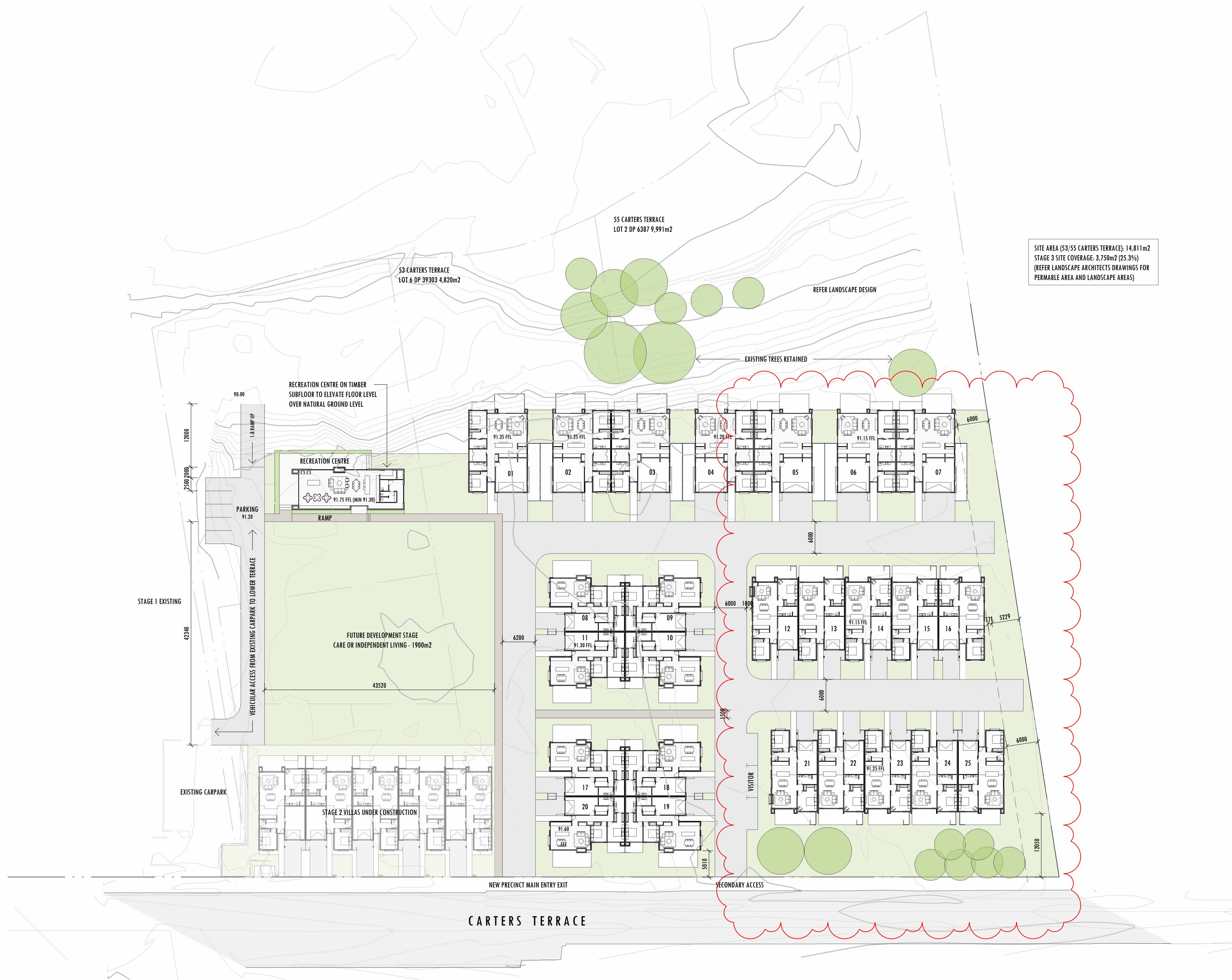
FIGURE & GROUND