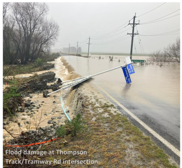
Flood damage at Thompson Track/Tramway Rd intersection.