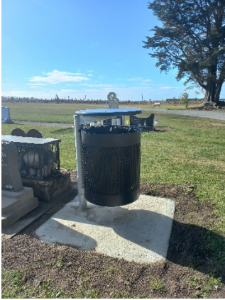
New black steel litter bins installed at the Cemetery.

General maintenance continues to be delivered at the Cemetery. Weed control is ongoing as is mulching. Staff have also been topping up graves as time allows.