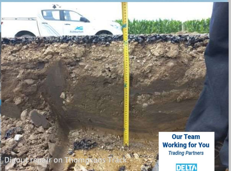
Digout repair on Thompsons Track