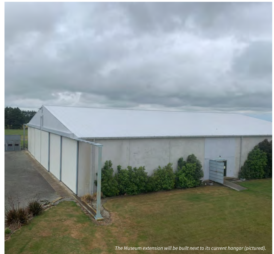
The Museum extension will be built next to its current hangar (pictured).