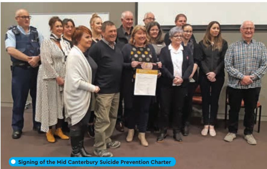
● Signing of the Mid Canterbury Suicide Prevention Charter