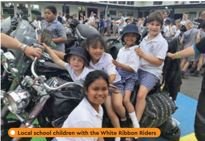
● Local school children with the White Ribbon Riders