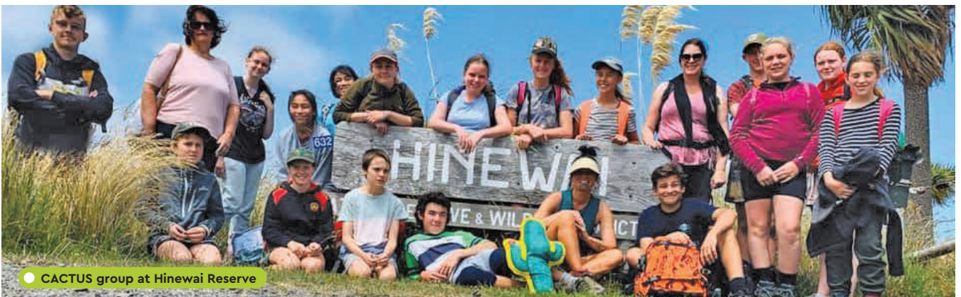
● CACTUS group at Hinewai Reserve