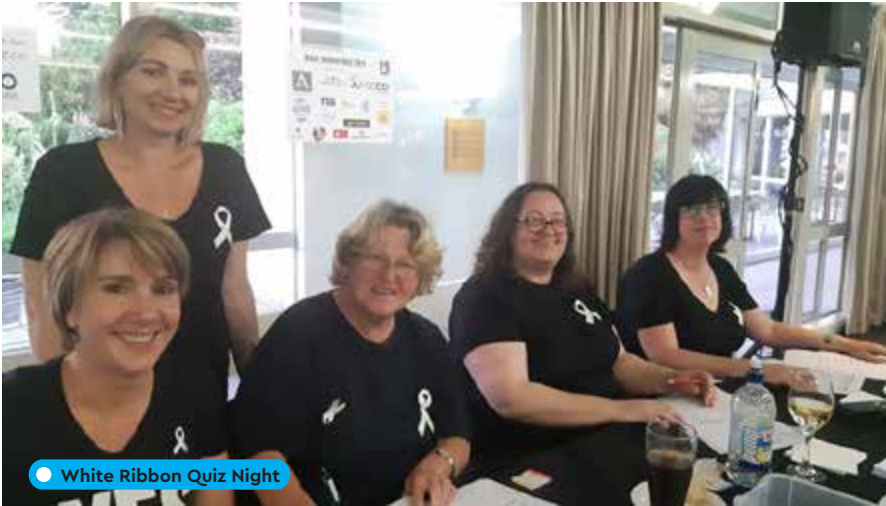
● White Ribbon Quiz Night