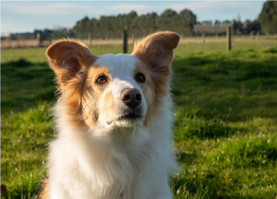
Border Collies are among the most popular dog breeds in the Ashburton District.

If your dog’s registration details have changed, such as a new address or ownership, or they are now deceased, you will need to contact Council by email or