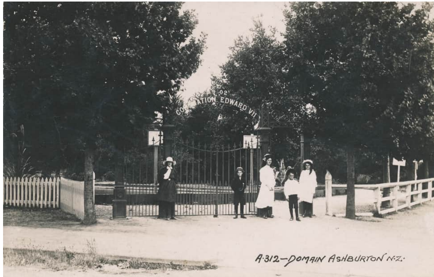
A312-DOMAIN ASHBURTON N.Z.

A 1905 New Zealand Government publication on Public Domains 1 listed the following information for Ashburton Domain: