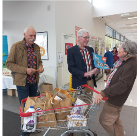
Councillors popped up at local supermarkets to talk about the LTP.