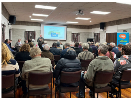
A meeting at Hinds, with a stockwater focus, attracted 52 people.