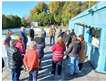
Councillors talk about the work needed to repair Tinwald Pool.