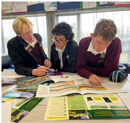
Senior students from Ashburton Christian School look through the consultation material.

Five key decisions have been highlighted, though feedback is welcome in any part of the draft plan.