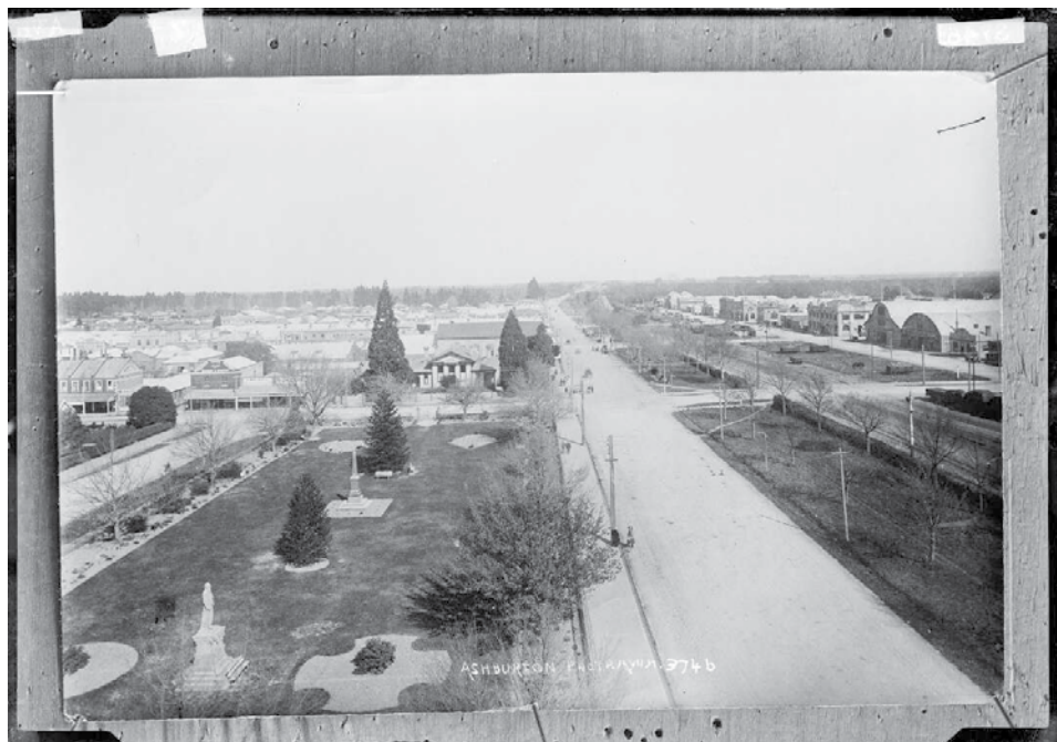
Ashburton, general view looking down East Street

“The major feature of all designs are the archway arbors in precast concrete of modern but traditional design which encircles the central open space. It is intended that they evoke the traditional feeling of walking beneath a cloister. Over time they will ‘mellow’ and carry ivy – again very much expressive of tradition”.