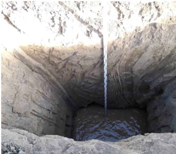
Photo – Soakage Test Pit 1