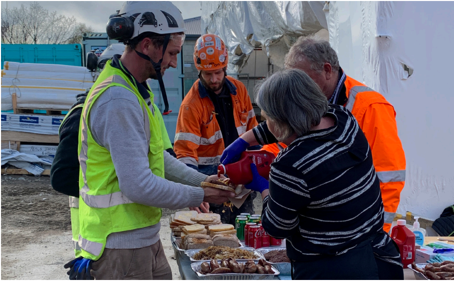
A BBQ shout for workers was to celebrate construction progress on the building.

"It's at an exciting stage and we thought it was timely to personally show our appreciation to everyone working on the building."