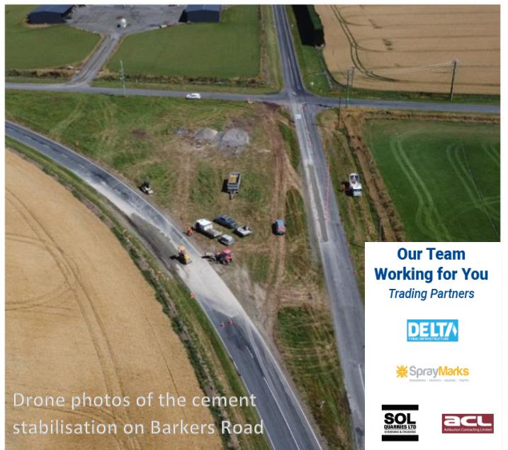
Drone photos of the cement stabilisation on Barkers Road

Intersection signage upgrade – Northeast Quadrant