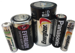
Alkaline, drycell & zinc