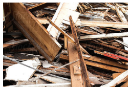
X Building materials

These items can be safely dropped off at the Ashburton Resource Recovery Park.