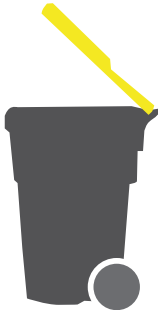
Recycling YELLOW BIN