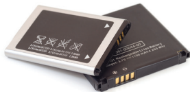
Li-ion (Laptops, cameras, cell phones, tools batteries)