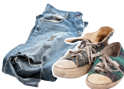
No clothes or toys