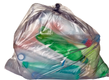
No rubbish or bagged recycling