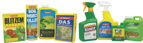
X Liquid and dry chemicals