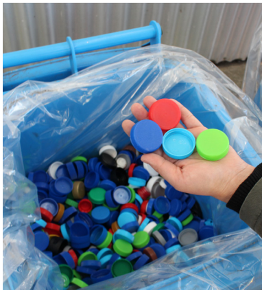
Plastic bottle tops

Tin can lids must remain attached to the can in order to be accepted in recycling.