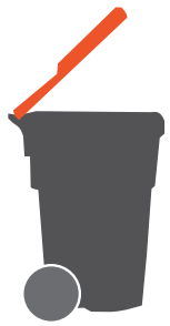
Rubbish RED BIN