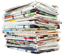
Paper, newspapers and magazines