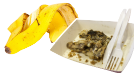
No food and no fast food packaging