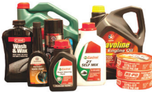
X Automotive products