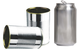
Aluminium cans and metal tins