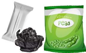
No soft or scrunchable plastic