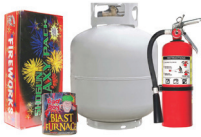
X Explosive and flammable materials

The following hazardous items are not accepted in any of our kerbside collection wheelie bins or crates: