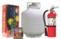
X Explosive and flammable materials

The following hazardous items are not accepted in any of our kerbside collection wheelie bins or crates: