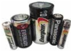
Alkaline, drycell & zinc