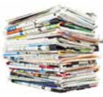
Paper, newspapers and magazines