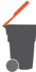
Rubbish RED BIN