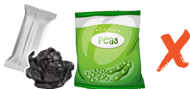
No soft or scrunchable plastic