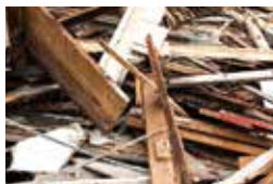
X Building materials

These items can be safely dropped off at the Ashburton Resource Recovery Park.