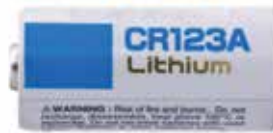
Other (NiCd, NiMH, gel cell, button cells, CR123 camera batteries)