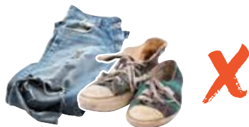
No clothes or toys