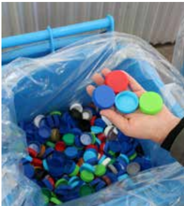
Plastic bottle tops

Tin can lids must remain attached to the can in order to be accepted in recycling.