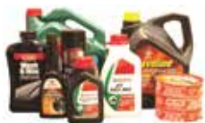
X Automotive products