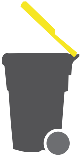
Recycling YELLOW BIN