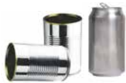
Aluminium cans and metal tins