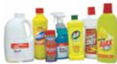
X Household chemicals