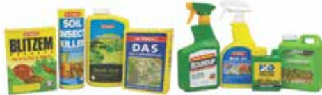
X Liquid and dry chemicals