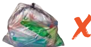
No rubbish or bagged recycling