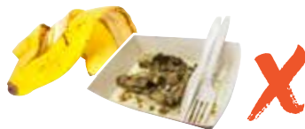
No food and no fast food packaging