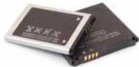
Li-ion (Laptops, cameras, cell phones, tools batteries)