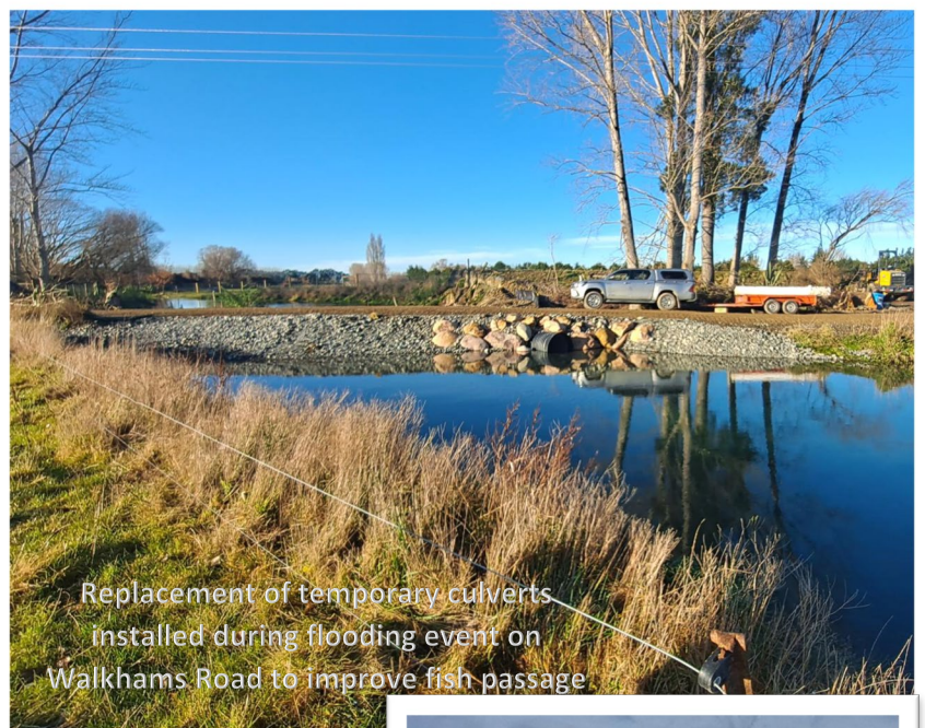
Replacement of temporary culverts installed during flooding event on Walkhams Road to improve fish passage