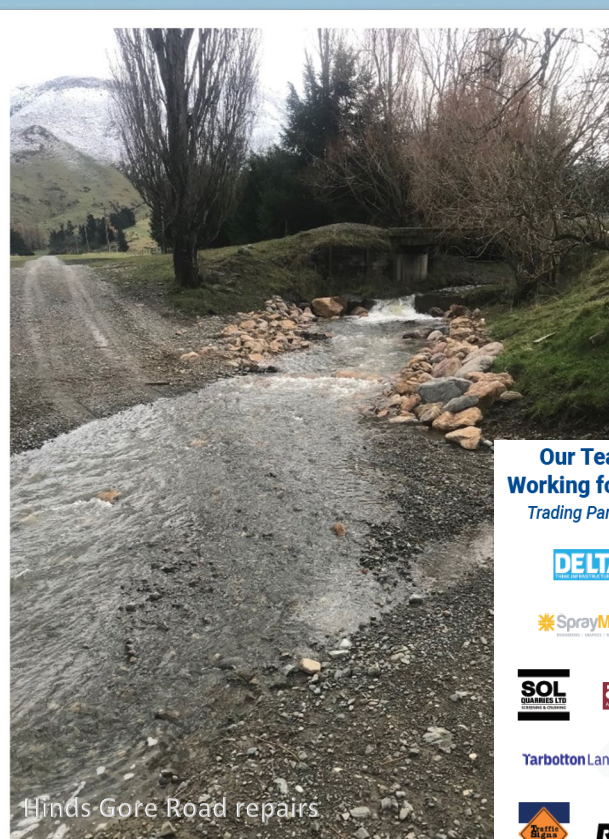
Hinds Gore Road repairs

Line Marking – All intersections & Townships