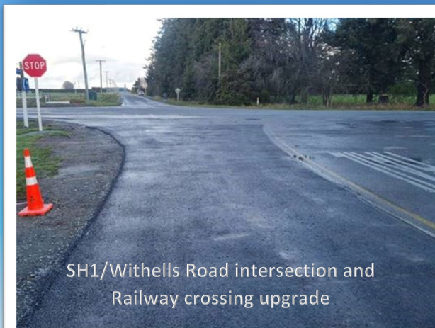
SH1/Withells Road intersection and Railway crossing upgrade

Our cyclic teams will continue maintenance on signs, pothole and edge break repairs and bridge maintenance.