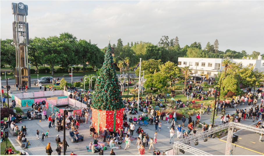
Baring Square East now hosts Council's Christmas event, Light up the Night.

“We’ve successfully held Christmas events and the Hakatere Noodle Market in the revamped area of Baring Square outside Te Whare Whakateru and surrounding streets, and there are also other Council-owned spaces that are available for events, rather than East Street south.”