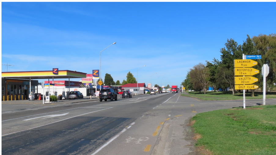
Traffic signals will be installed at the intersection of SH1/Lagmhor Road/ Agnes Street to create regular gaps for side street traffic.