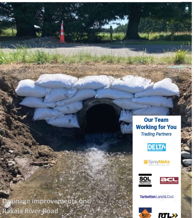
Drainage improvements on Rakaia River Road

Bridge Maintenance – 2 x Bridges on Surveyors Road and Stanley Road