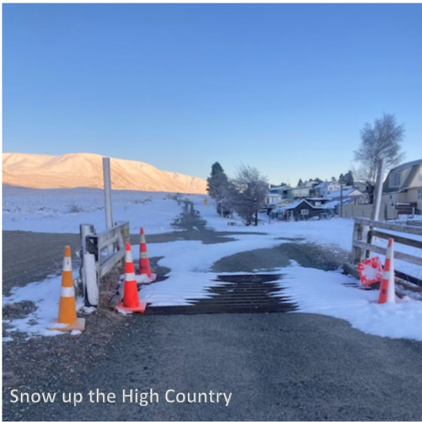
Snow up the High Country

Lee Sparrow completed marking, measuring and quantifying the repairs on the reseal sites earmarked for the 2022/23 season. Our focus next month will shift to identifying sites for heavy maintenance from the completed all faults data.