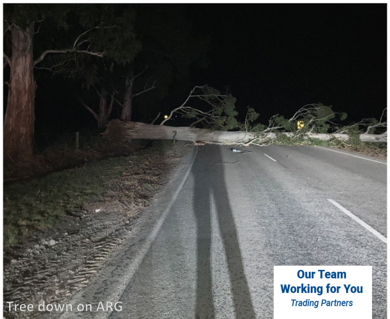
Tree down on ARG