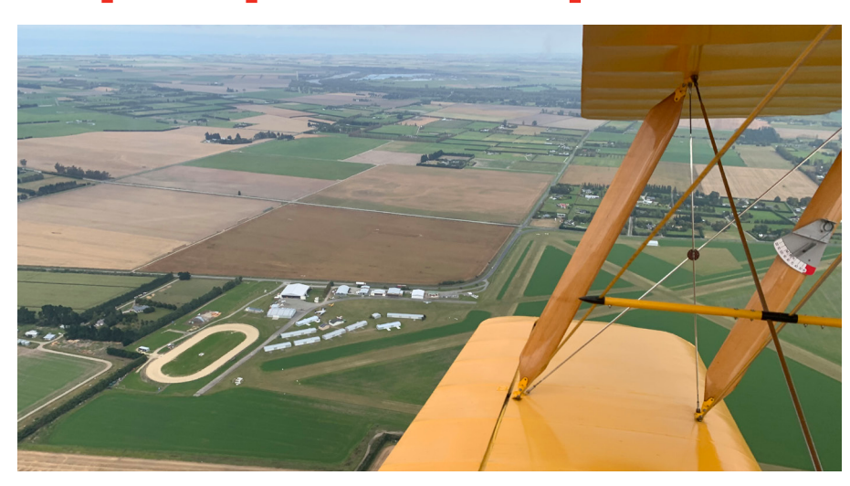
A development plan for the Ashburton Airport has been adopted.

Community feedback has helped shape the final Ashburton Airport Development Plan, which was adopted by Council recently.