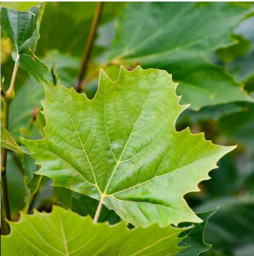
PLATANUS X ACERIFOLIA / LONDON PLANE TREE