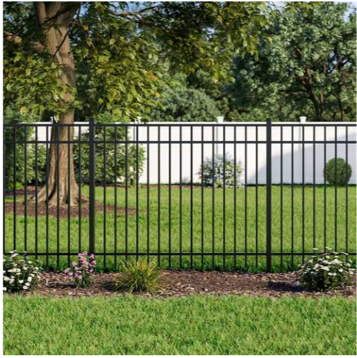
BLACK ALUMINIUM FENCING