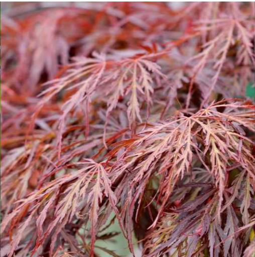
ACER 'CRIMSON KING' / DWARF JAPANESE MAPLE