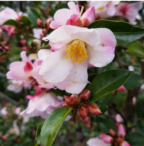
CAMELLIA 'FAIRY BLUSH' / UPRIGHT CAMELLIA