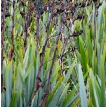
PHORMIUM TENAX / SWAMP FLAX