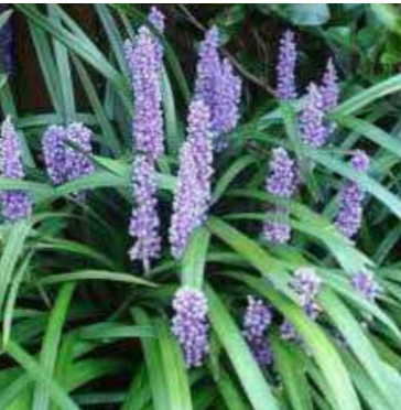
LIRIOPE MUSCARI / LILYTURF