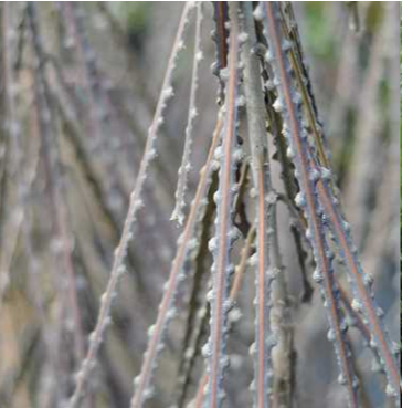
PSEUDOPANAX FEROX / LANCEWOOD