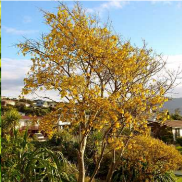
SOPHORA MICROPHYLLA / KOWHAI