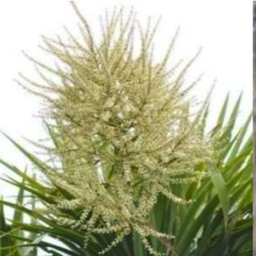
CORYDLINE AUSTRALIS / CABBAGE TREE