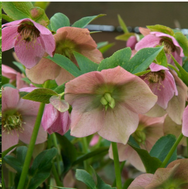
HELLABOROUS SPECIES / WINTER ROSE