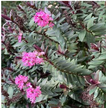
HEBE DWARF SPECIES