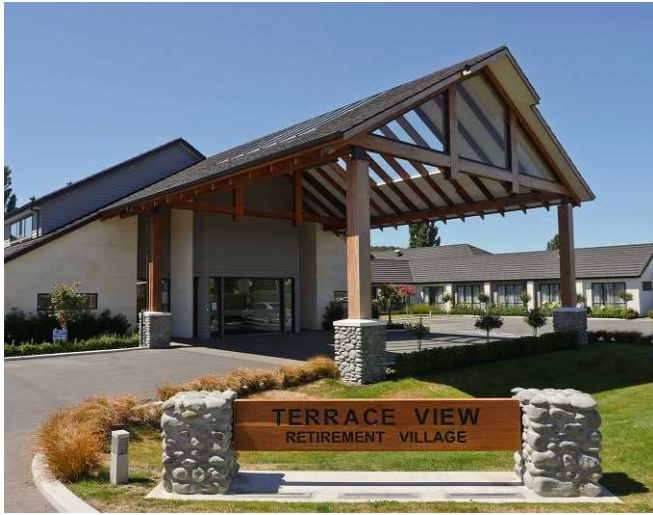
RIVERSTONE WALLS / COLUMNS TO MATCH EXISITNG RIVERSTONE USED WITHIN THE VILLAGE