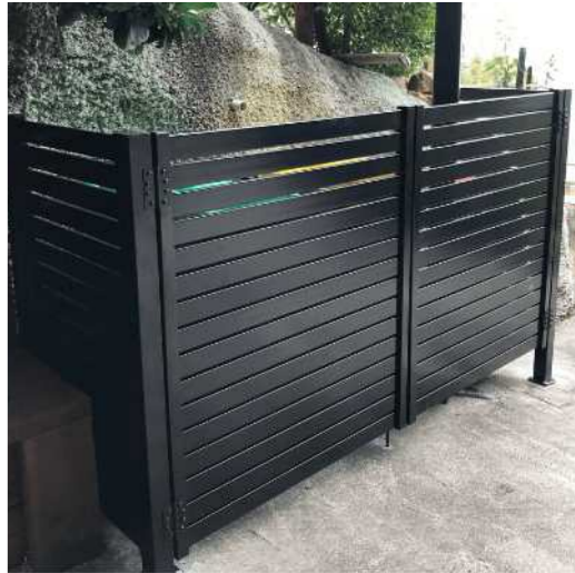
1.4M HIGH BIN ENCLOSURE