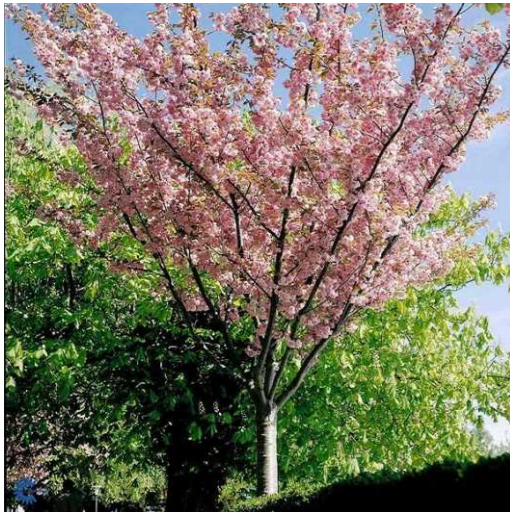
PRUNUS SPECIES / FLOWERING CHERRY