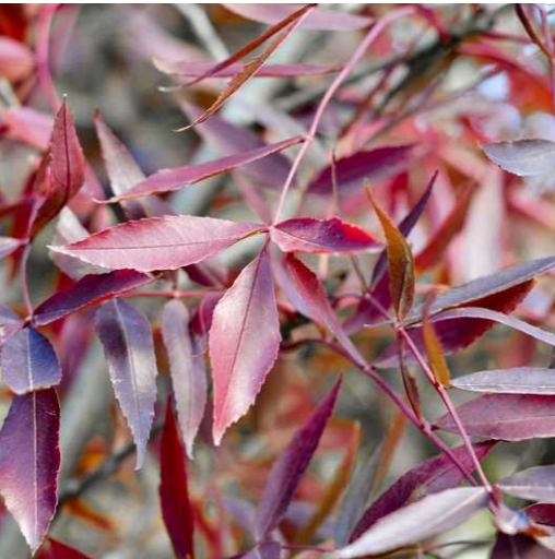
FRAXINUS RAYWOODII / CLARET ASH