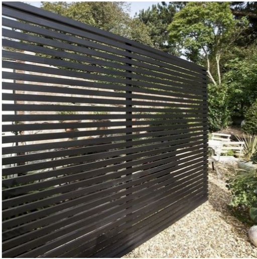
HORIZONTAL SLATTED SCREEN