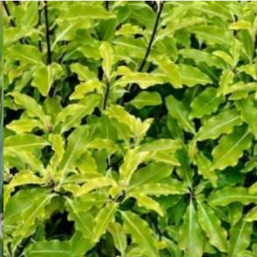
PITTOSPORUM EUGENIOIDES / LEMONWOOD