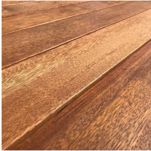
KWILA TIMBER DECKING