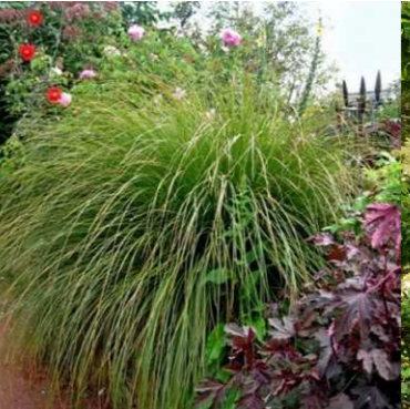
CAREX VIRGATA / SEDGE