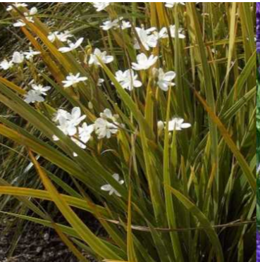
LIBERTIA IXIODES/ NZ IRIS