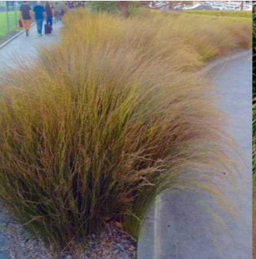
APODASMIA SIMILIS / OI OI