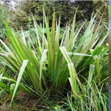
ASTELIA GRADIS / SWAMP ASTELIA