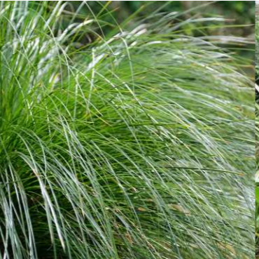
CAREX SECTA / SEDGE