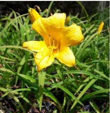
HEMEROCALLIS 'STELLA BELLA' / EVERGREEN DAYLILY