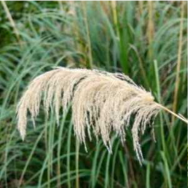
AUSTRODERIA RICHARDII / SOUTH ISLAND TOI TOI