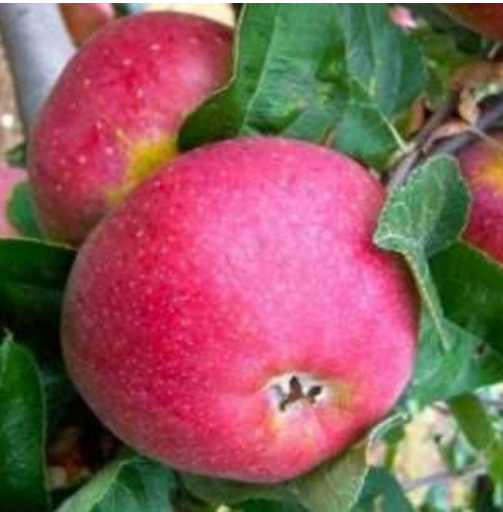
FRUIT TREES / VARIOUS SPECIES