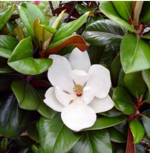
MAGNOLIA 'TEDDY BEAR' / DWARF EVERGREEN MAGNOLIA