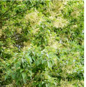
PLAGIANTHUS REGIUS / RIBBONWOOD

NOTE THIS PLAN IS AT A CONCEPTUAL LEVEL SUBJECT TO FURTHER DESIGN DEVELOPMENT. IT IS NOT TO BE SCALED OFF OR USED FOR ANY CONSTRUCTION PURPOSES