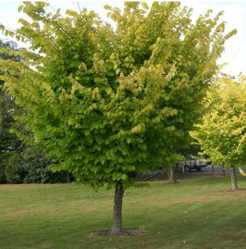
ULMUS LOUIS VAN HOUEITE / GOLDEN ELM