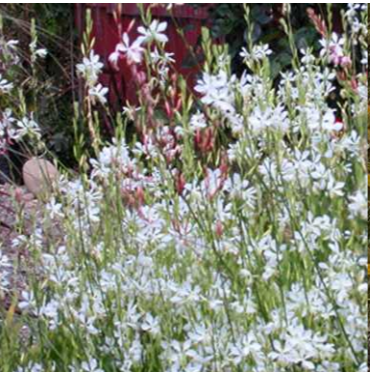
GAURA 'SO WHITE'