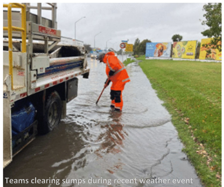
Teams clearing sumps during recent weather event

Completed Digout Quantity for this Financial Year - 18,946m2