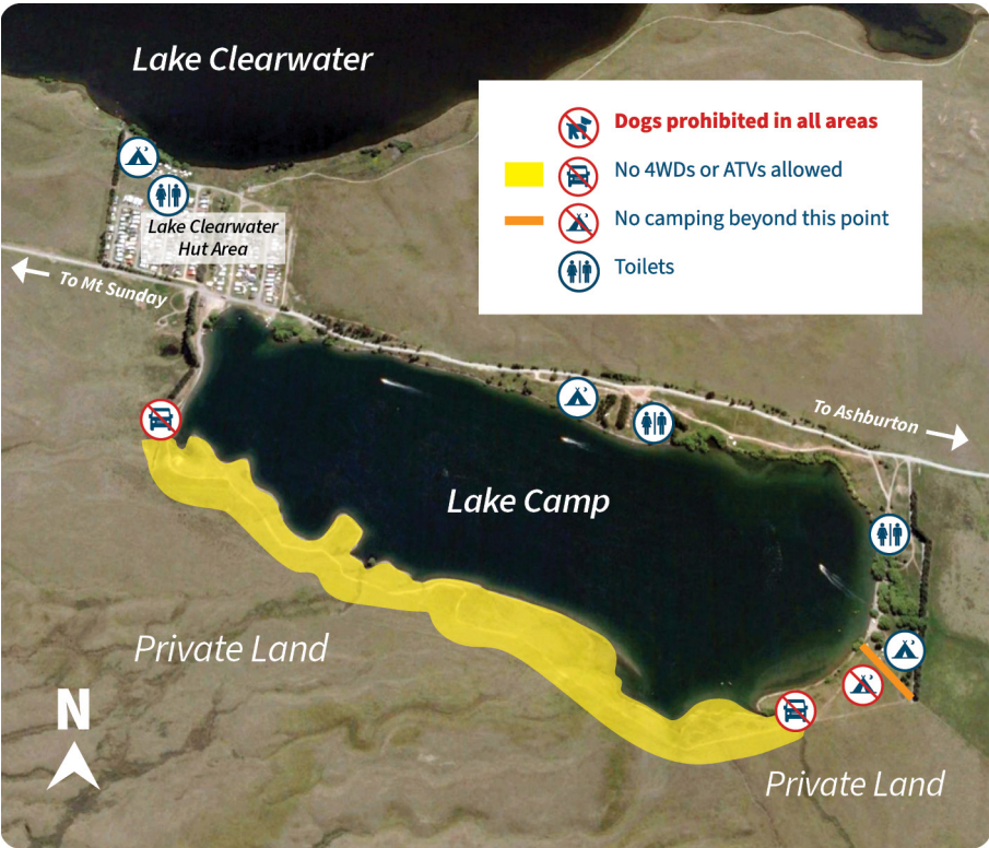
A brochure for visitors will outline the protections in place for the lakes area.

There are concerns about water quality in Lake Clearwater and long-drop toilets