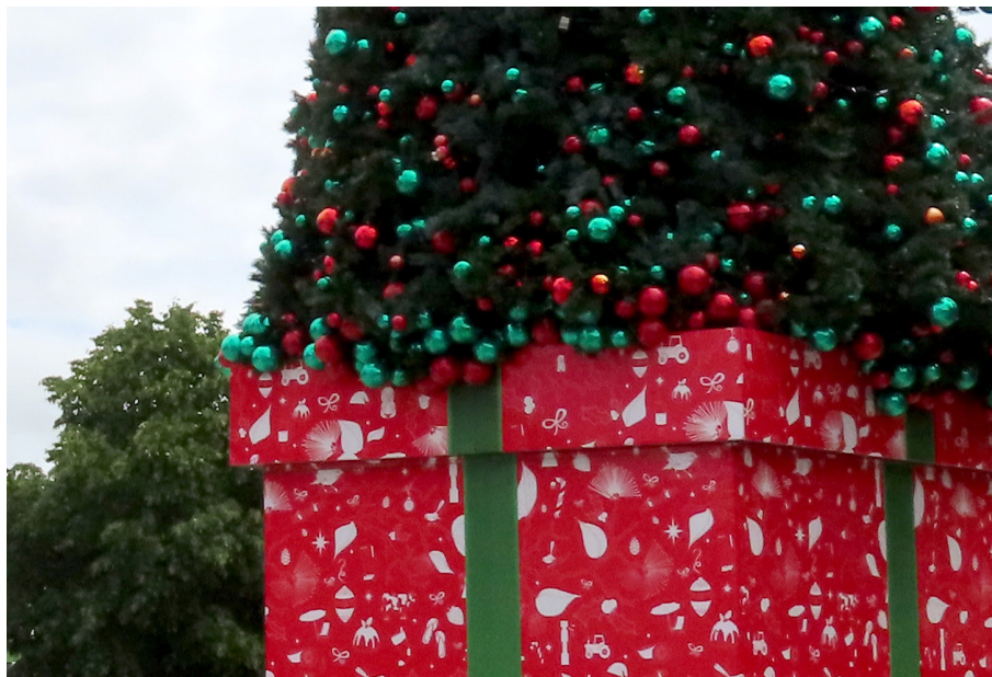
Ashburton's Christmas tree will be on the East Street green again this year, and will come alive with lights and colour on Friday 2 December.