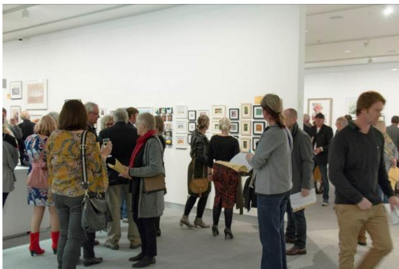
Image: Guests at the opening of the ASA exhibition, 2019