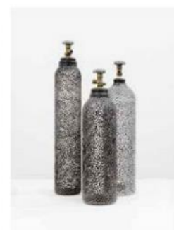
TOP LEFT / A Walk in the Alps (Axis Mundi) , work in progress, 2019 by David Rickard. TOP RIGHT / Last Gasp, CO2 Cylinders , 2013 by David Rickard. LEFT / X , C-Type Photographs, 2018 by David Rickard.

Mozambique, Western Australia, French Polynesia and Brazil, David uses four global co-ordinates that are located at exactly the same latitude and separated by 90 degrees in longitude, like the 'four corners' of the earth. He explains that 'through collaboration with people in each country local sticks were placed in the ground like simple markers, forming the points of a very large 'X'. The resulting work is both an installation, and also the documentary photographs which echo historic diagrams by the likes of Cosmas Indicopleustes who denied the world was a sphere.'