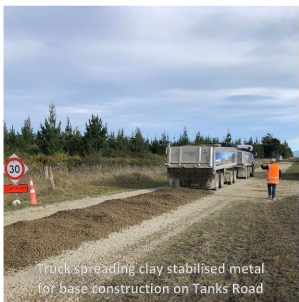
Truck spreading clay stabilised metal for base construction on Tanks Road

Footpath renewal works will also commence with our Trading Partner establishing early June to complete work on Davidson Street