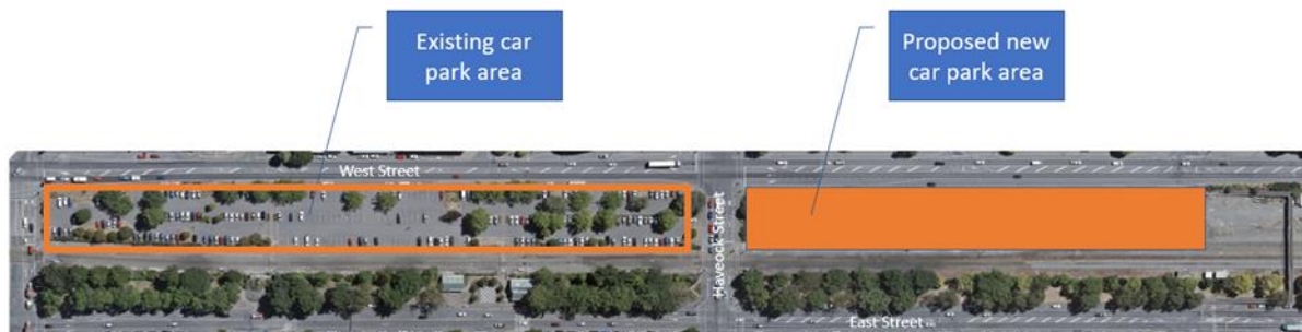
Figure 6.1 Location of new car parking as proposed by Council

The proposed area can accommodate 100-130 car park spaces depending the space available for use. It is proposed this area will be laid out in a similar way to the existing West Street car park and will accommodate all day parking. There may be some changes to the existing West Street car park time restrictions to accommodate more short term parking for town centre visitors.