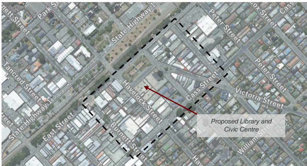
Figure 5.1 Assumed on-street parking catchment for the new library and civic centre visitor parking.

The area shown in Figure 5.1 is assumed to be where a visitor to the new library or the civic centre would park on-street. Of this area, only the streets to the south of Havelock Street were surveyed in 2017. Table 5.2 outlines the surveyed peak occupancy within this area in November 2017.