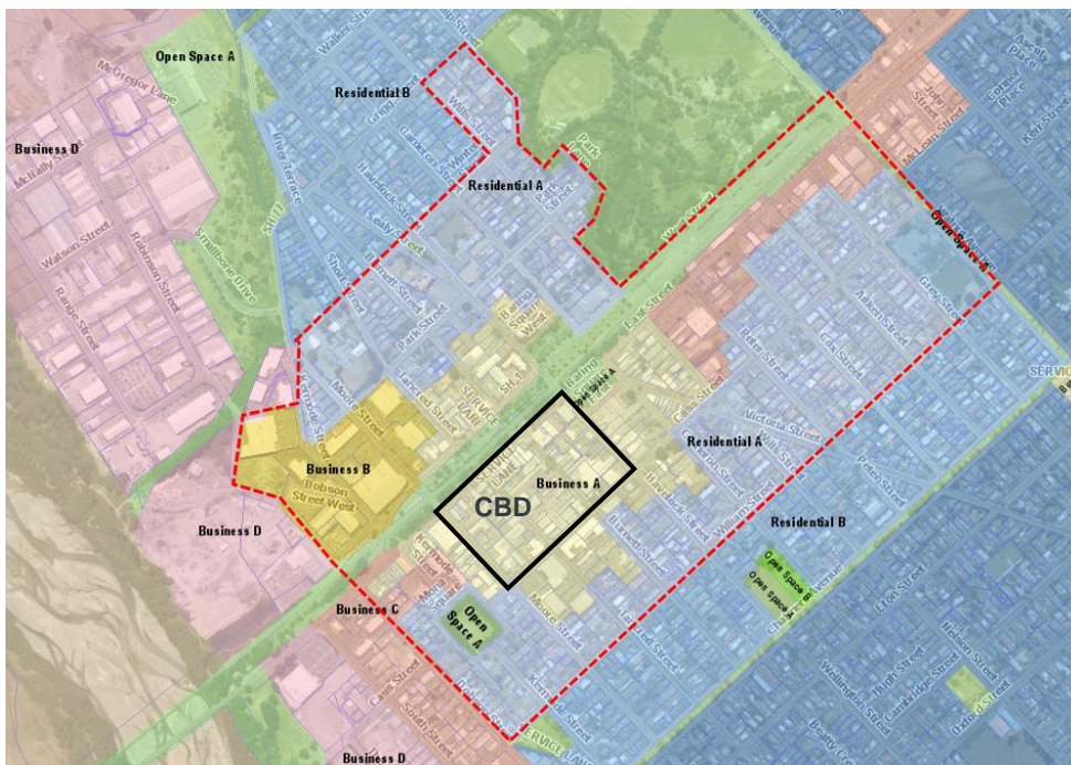
Figure 1.1 Ashburton town centre parking plan scope

The geographic scope of the Ashburton Town Centre Parking Management Plan is shown in Figure 1.1 by red dashed line. The area includes some residential parking due to its close proximity to the business activities and hence those streets being used for non-residential parking. The CBD area is identified as this is referred to throughout the plan.