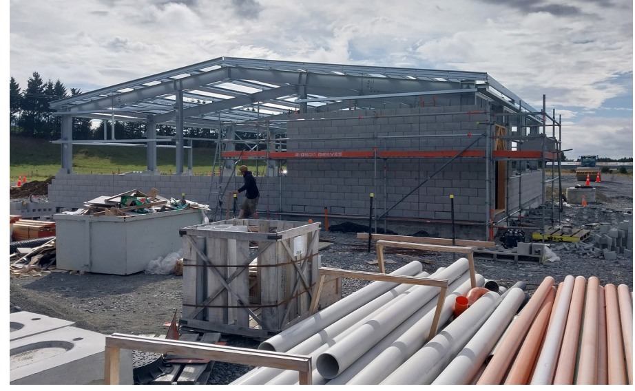
The new Mount Somers water treatment plant under construction.

"We're really pleased at how this project is