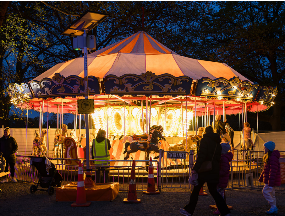
The carousel will be operating during the low sensory sessions.

The low-sensory sessions are also open to people with accessibility requirements,