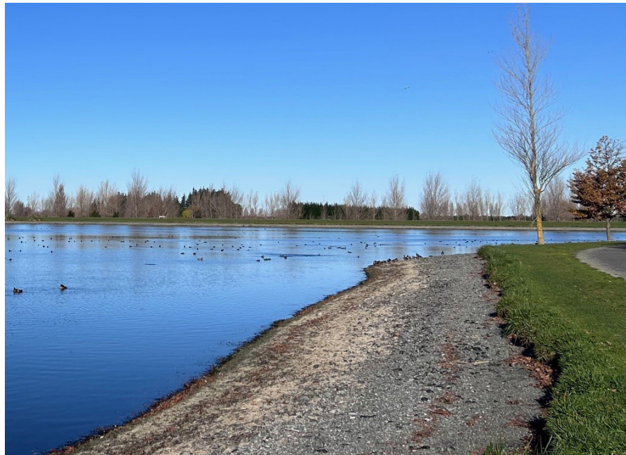
Water levels are low in Lake Hood at the moment to allow for seasonal flushing and maintenance on boat ramps and banks.

The report highlights three main themes to help tackle water quality issues: identifying options for mitigating cyanobacteria blooms using a scientific approach, improving the intake and outlet infrastructure, and consenting options to