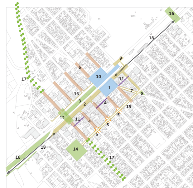
Proposed Implementation Plan

Once an overall Concept Plan is accepted, the Council can then proceed to design specific parts of the town centre in greater detail, where more technical issues can be resolved and implemented over time through its Community Plan. Where land use changes are proposed, the District Plan review process, currently running in parallel, can give effect to these changes through new zonings and development controls.