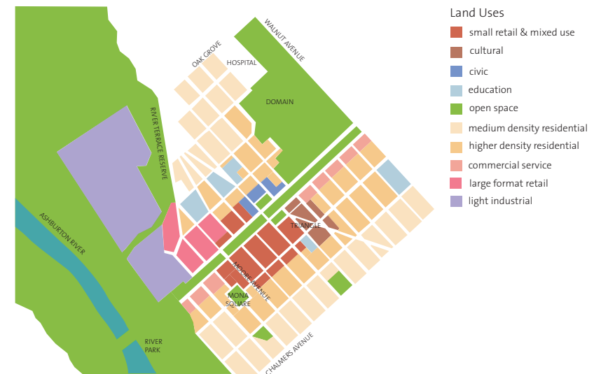
Indicative Land Use Plan