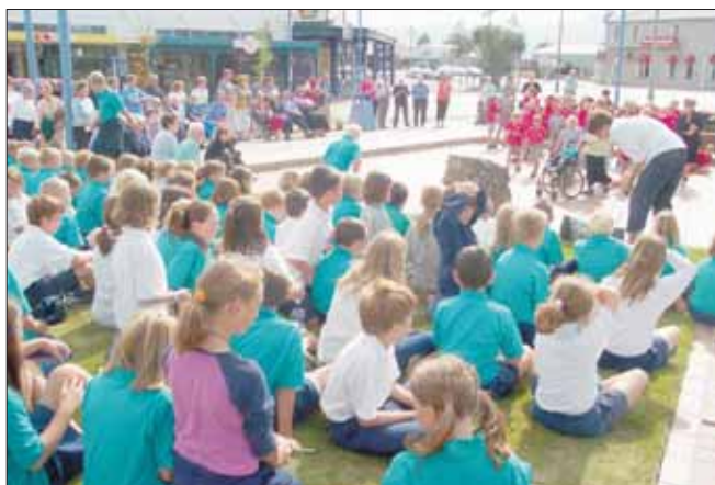
After just over two years of work the redevelopment of the Methven Town Centre was officially opened late in March, with school children, council staff and members of the community taking part in the celebration.