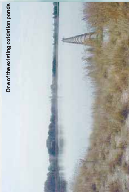
One of the existing oxidation ponds

By the time the water is ready to irrigate the 260 hectares of farmland