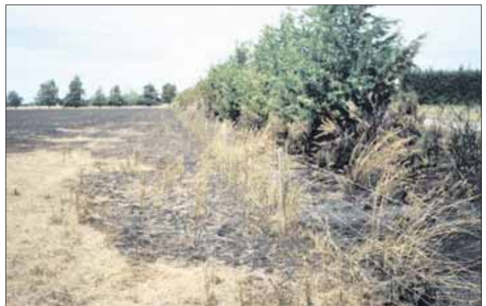
Not the way to do it

By being more aware and responsible the community can considerably reduce the incidence of avoidable rural fire callouts and loss of property. This will also reduce the demands on our volunteer fire fighters who so willingly turn out at any time of the day or night for no reward other than the satisfaction of providing an invaluable community service. We should all be more considerate of these people, their families and their employers.