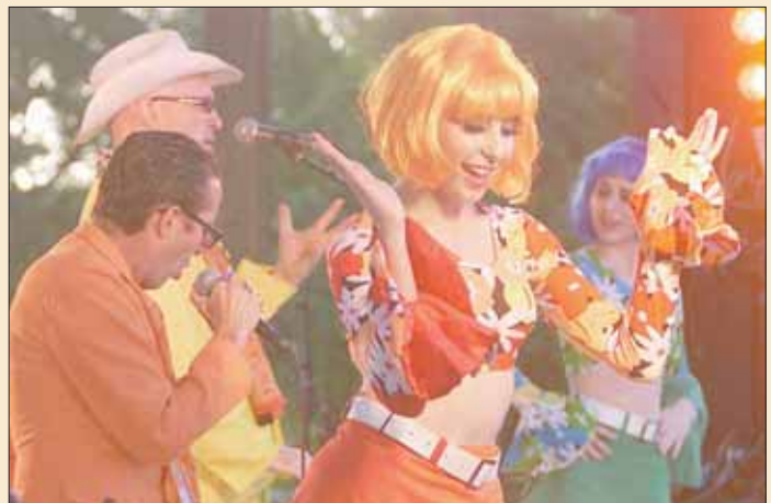
The group Vague-As Brothers performing at the Concert In The Park

Children from Netherby School helped introduce the Christmas season when they sang Christmas carols at a ceremony to turn on the lights of Ashburton's official Christmas tree at the Library.