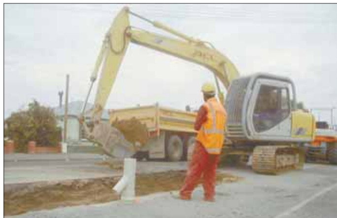
Work under way recently to replace stormwater mains in Victoria Street

C369 - Ashburton Water Leak Detection Programme 2002/2003, Detection Services Limited, $24,200.00