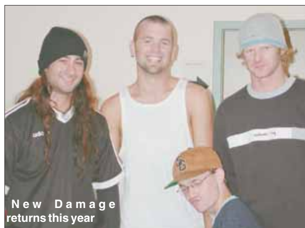
New Damage returns this year

Organised by the Ashburton Youth Council the concert is Ashburton's Big Day Out, an opportunity for awesome full-on entertainment.